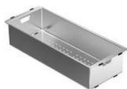
AQBCO COLANDER 445 X 165mm